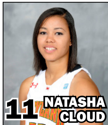
Fr. • G • 6-0 • Broomall, Pa.