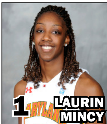
Fr • G • 6-0 • Newark, N.J.