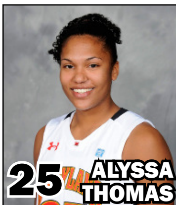
Fr. • F • 6-2 • Harrisburg, Pa.