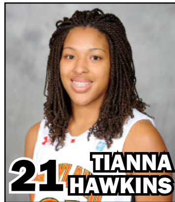
So. • F • 6-3 • Clinton, Md. (tee-AH-na)