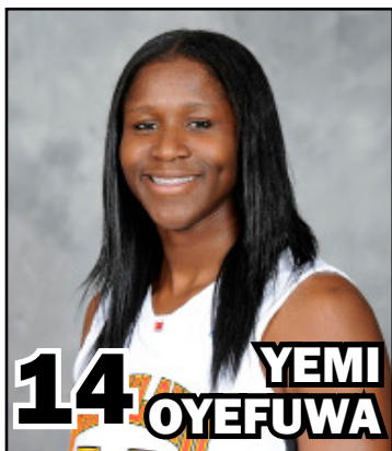
Jr. • C • 6-6 • London, Eng. (YEH-mee oh-yay-FOO-wah)