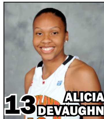
Fr. • C • 6-4 • West Palm Beach, Fla. (ah-LEESH-ah)