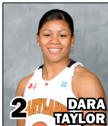
So. • G • 5-7 • Wilmington, Del. (DARR-ah)