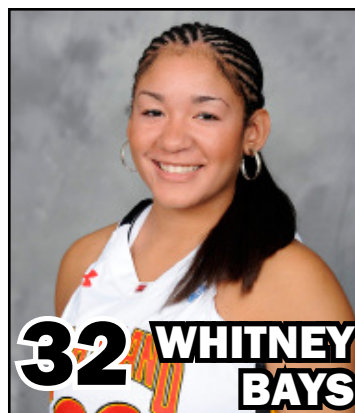
Fr. • F • 6-2 • Huntington, W.Va.