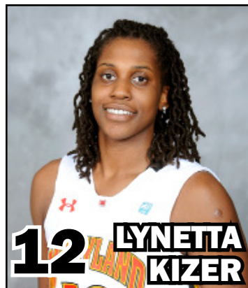
Jr. • C • 6-4 • Woodbridge, Va.