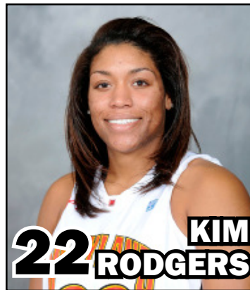
Jr. • G • 5-9 • Virginia Beach, Va.