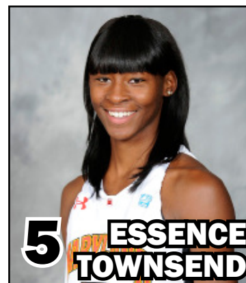
So • C • 6-7 • Paterson, N.J.