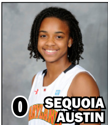
Fr • G • 5-5 • Greenbelt, Md.